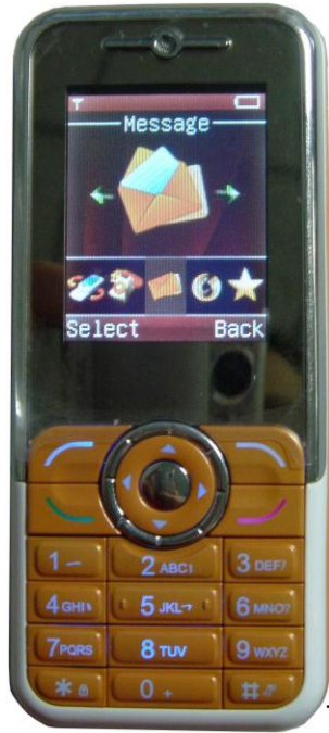
----- Orange Color