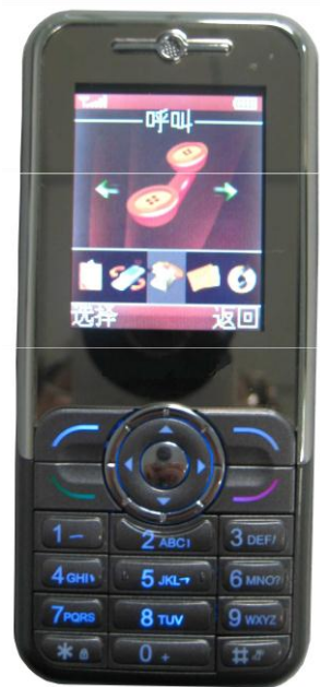
----- Black Color